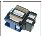
Table-top cleaver FC-6 / FC-6R series