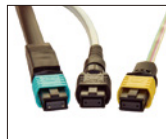
Available for Lynx-Custom Fit™ Splice-On Connector