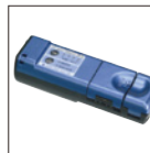
Hot jacket remover JR-6