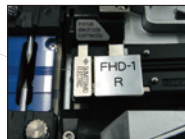
Drop cable splicing with fibre holder system