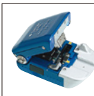
Handy cleaver FC-7 / FC-7R series